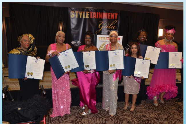
2023 Breast Cancer Honorees